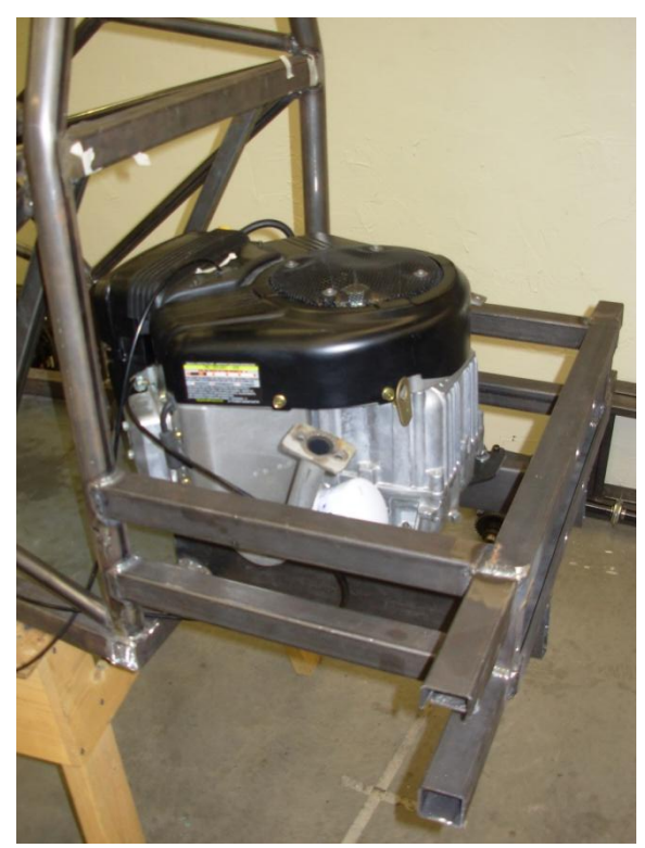
Back end with engine mounted. The rear axle is almost done.