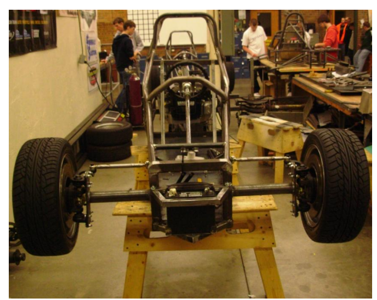
Chasses with the front axle complete with battery in front for added traction.